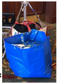
(right) Clothing Donations for 'Working Wardrobe' started rolling in too!